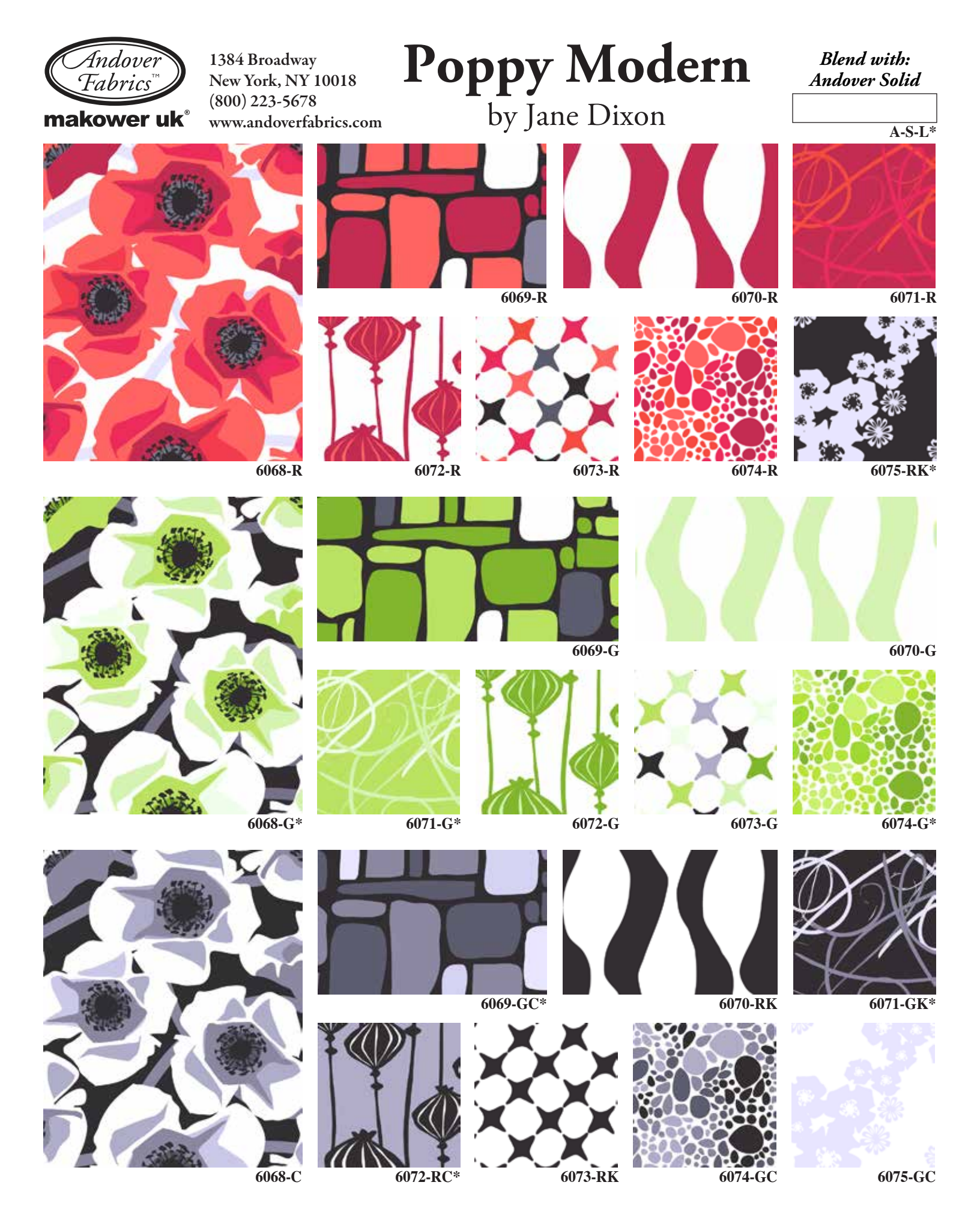
*Indicates fabric used in quilt pattern. Fabrics shown are 25% of actual size. Free Pattern Download Available at www.andoverfabrics.com 12/28/12